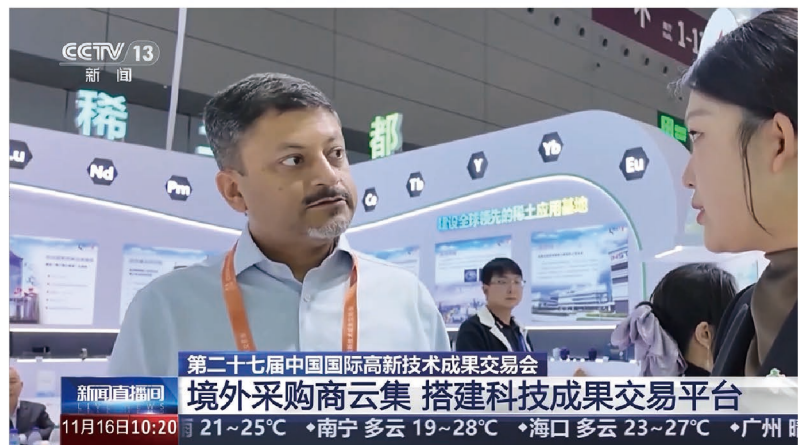
CCTV News Reports on the Grand Occasion of the 27th China Hi-Tech Fair